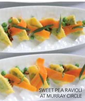
SWEET PEA RAVIOLI AT MURRAY CIRCLE