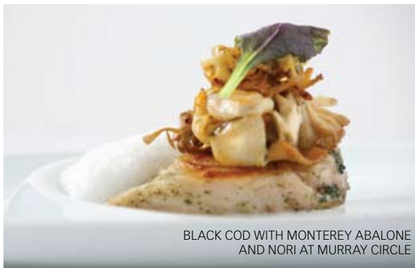
BLACK COD WITH MONTEREY ABALONE AND NORI AT MURRAY CIRCLE