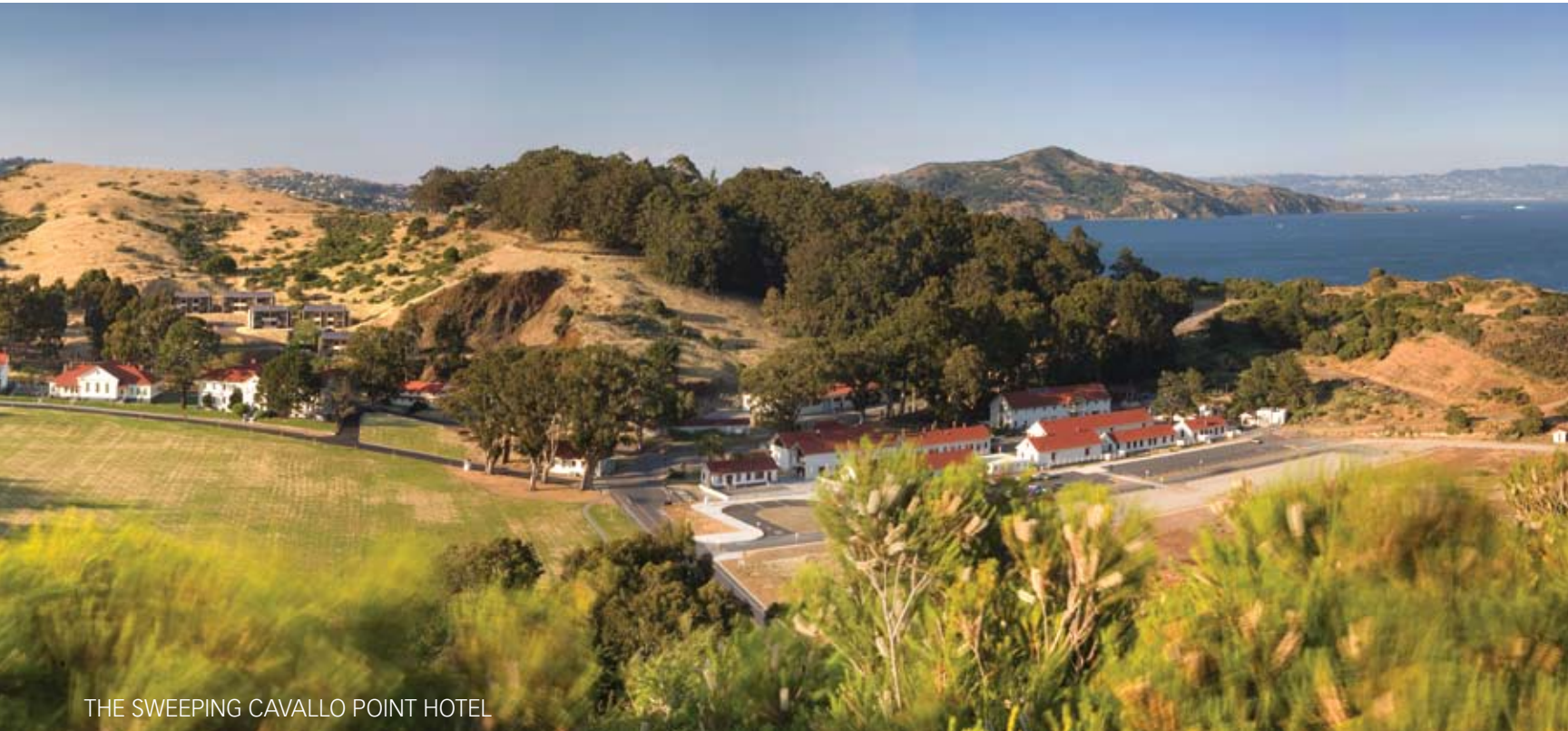
THE SWEEPING CAVALLO POINT HOTEL