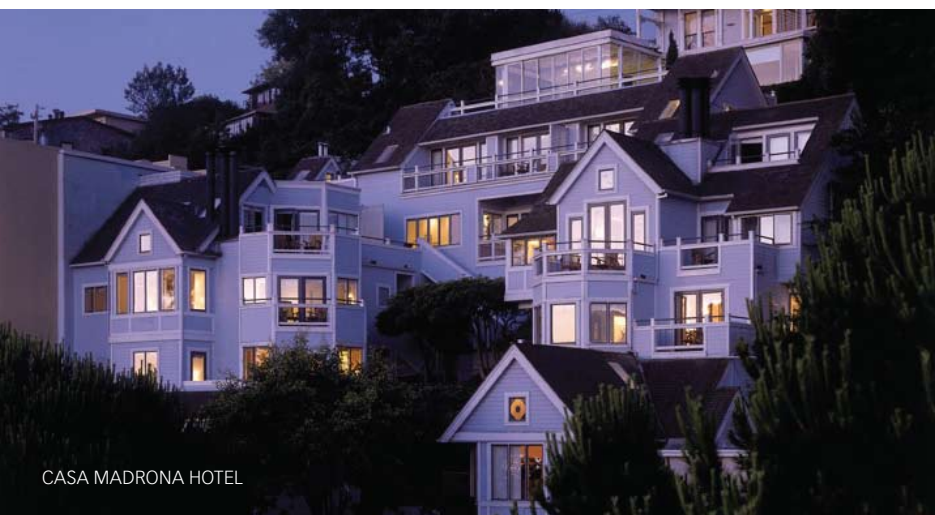
CASA MADRONA HOTEL