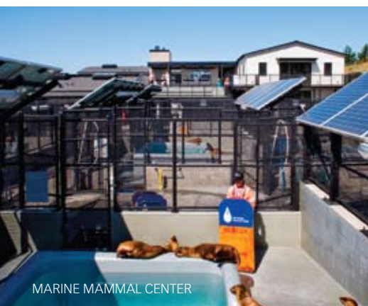
MARINE MAMMAL CENTER